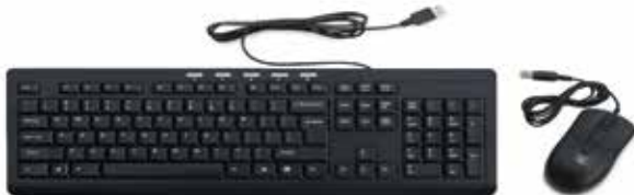
Keyboard and Mouse